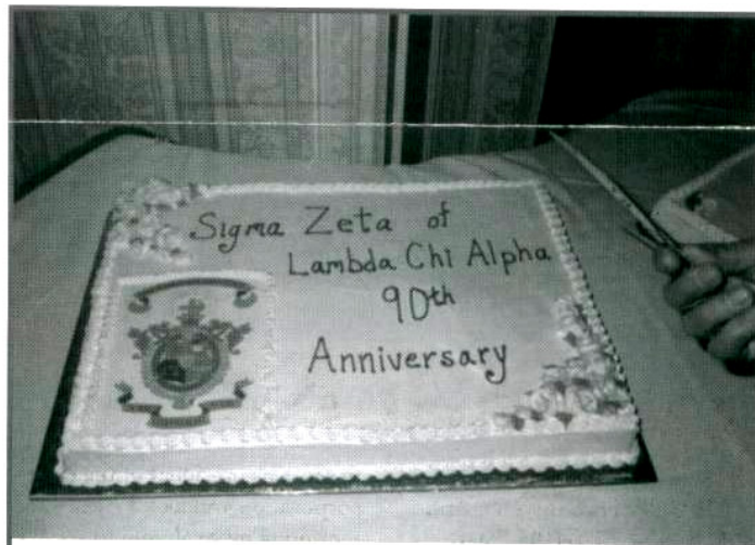
Sigma at Michigan Celebrates 90th Anniversary, Return of Charter. Details Page 3