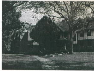
The colony will live in this house at 707 Oxford until fall 2002.