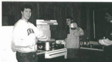
(Left) Cookin' at Colony Retreat, Holly, Mich.