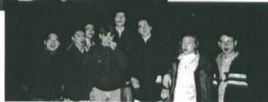
(Below) Brothers pose for a shot during Retreat.