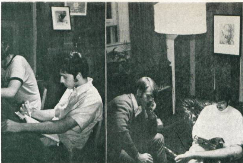
Studying is easier in a pleasant environment.