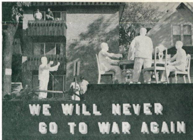
The Sigma Zeta entry, entitled "We Will Never Go To War Again" which won first prize in the Homecoming competition.