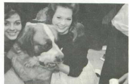
Who asked you to butt in?