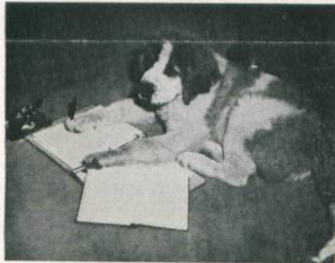
"A man has three apples. He gives one of them to John, and eats another . . ."