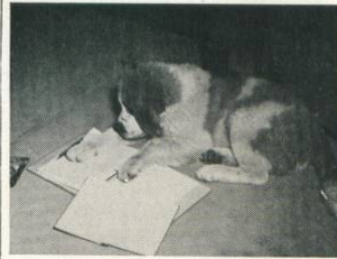
"How many has he left . . . boy, that's a toughie! Two? Four? Three?"

Excuse me while I arrange myself comfortably, draw up my smelliest rug, and reach for my most choice shoe to nibble on. (Ed.: So that's where it went!) Well, I'm pretty well settled here now. Don't want to seem cocky, but if you'd ask me I'd tell you that I know all the ropes. For instance, I know a dilly for getting fed. It's ridiculously simple. All I do is stand there and sniff suggestively.